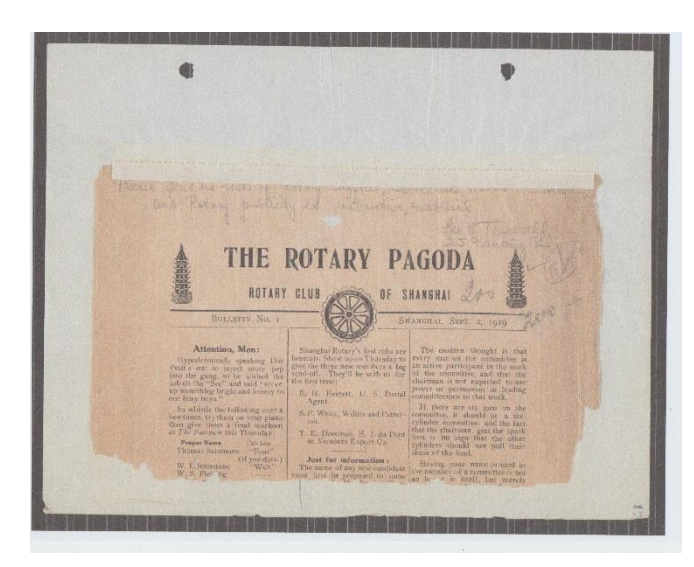
Pagoda 1st edition

End of story — In the early years, the birth of a Rotary Club might be regarded to the earliest organizing meeting. For the case of Shanghai, sometimes the record shown the date "July 1919". However, if we are talking about the full membership to Rotary International, the date should be referred to the admission date "1 October 1919".