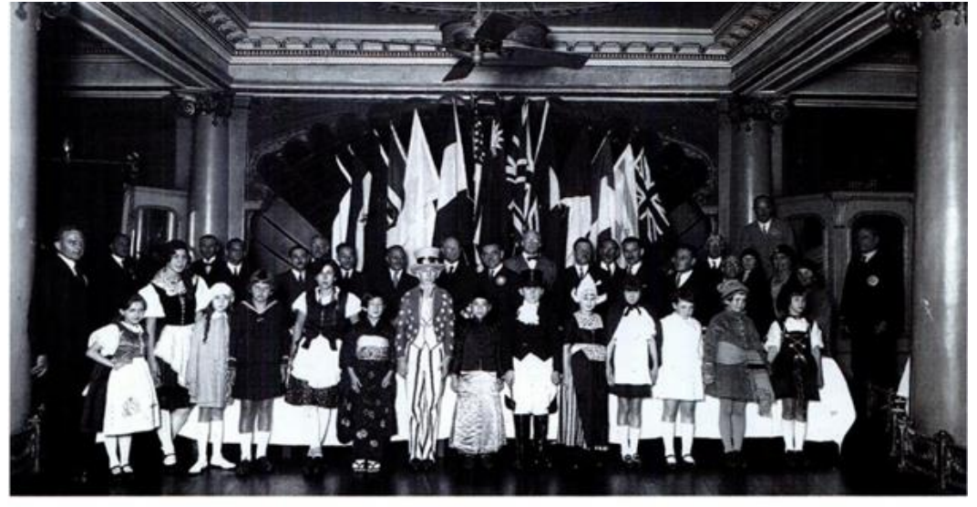
A Rotary flourished in China before World War II. Above, the Shanghai club, chartered in 1919, celebrates International Flag Day in 1929.